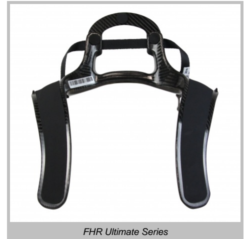
FHR Ultimate Series

Exceptional ergonomics, geometrics and lighter weight! World champion in F1, WEC, WRC, etc.